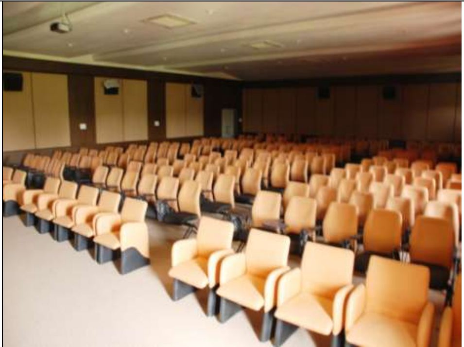
Auditorium / Seminar Halls / Amphi