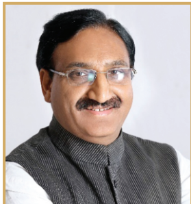
रमेश पोखरियाल 'निशंक' मानव संसाधन विकास मंत्री

स्टार्ट-अप इंडिया भारत सरकार की एक प्रमुख पहल है, जो नवीन आविष्कारों को हाथ में लेने, सहायता और प्रोत्साहनों के वित्त पोषण, उद्योग-शैक्षणिक भागीदारी और इन्क्यूबेटरों के बुनियादी स्तंभों पर आधारित है।