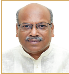
Sanjay Shamrao Dhotre Minister of State for Human Resource Development

India aspires to become a 5 trillion dollar economy in a near future. To reach this mark, it needs to evolve system and mechanisms to convert the present demographic dividend into high quality technical human resource, capable of doing cutting edge research and innovation, and deep-tech entrepreneurship. At this juncture, the MHRD's Innovation Cell and AICTE have brought out the 'National Innovation and Startup Policy 2019' for students and faculty.